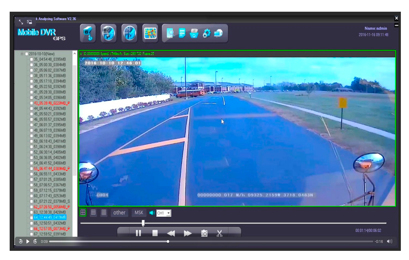
SD4HW is Backwards compatible with Analog cameras sold over the last 25 years from FMI/ABV